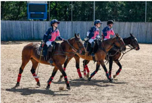
Papplewick players in the Beaufort arena

season is always a favourite and 2025 was no exception. 66 young players, aged 8 to 13, came from schools across the country, eager to show their polo abilities in the arena and on the field. The morning saw Beginners and Novices getting stuck in with super keen arena play, while Intermediate and Open Divisions took to the grass under glorious sunshine for a thrilling afternoon of polo.