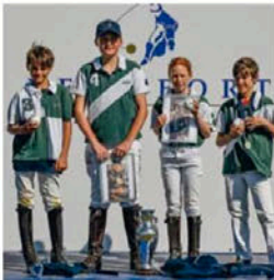
Open winners, Beaudesert with their signed photograph prizes